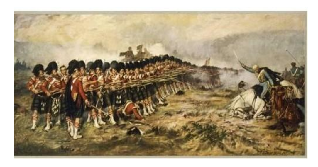
The Thin Red Line – 93<sup>rd</sup> at Balaclava

As part of the restructuring of the British Army's infantry in 2006, the Argyll and Sutherland Highlanders were amalgamated with the Royal Scots, the King's Own Scottish Borderers, the Royal Highland Fusiliers (Princess Margaret's Own Glasgow and Ayrshire Regiment), the Black Watch (Royal Highland Regiment) and the Highlanders (Seaforth, Gordons and Camerons) into the seven battalion strong Royal Regiment of Scotland. Following a further round of defence cuts announced in July 2012 the 5th Battalion was reduced to a single public duties company called Balaklava Company, 5th Battalion, Royal Regiment of Scotland, (Argyll and Sutherland Highlanders).